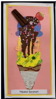
Ice Cream Art